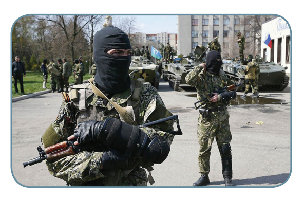
Armed militants roam the streets of Slavyansk

Over the past 10 months, Eastern Ukraine has been embroiled in a conflict between pro-Russian separatists and Ukrainian military forces. Ukrainian civilians, including many children, have been caught between the two warring factions. With your rapid financial help, our partners in Eastern Ukraine have worked tirelessly to evacuate orphans and families with children from at risk areas, and also to provide critical food and medical supplies to those who were not able to evacuate.