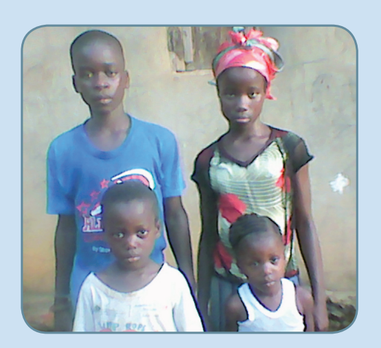
Your gifts are helping find families and provide for the physical needs of Ebola orphans like these siblings.

Your giving this year has enabled a Liberian team of Ebola survivors (who are immune to the disease) to care for 163 of the neediest Ebola orphans. Throughout 2015, these national Christians will be providing food and school fees for these children, as well as working to place them into Christian adoptive or foster families.